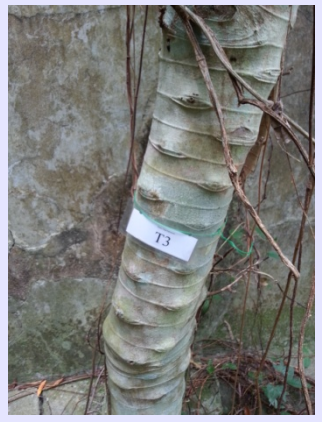
Undertaking tree survey at Yung Shue Ha Old Village