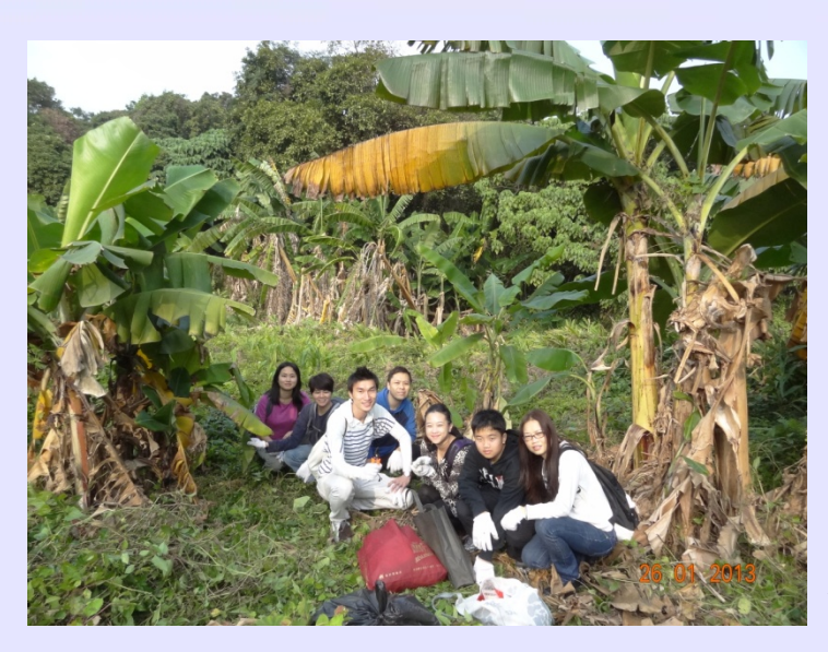
First attempt for the volunteer team of the Baroque on Lamma and Agile Property Holdings Limited to organise a challenging Mikania clean-up day trip.