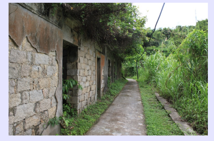
Pilot Project: 2 of the crumbled village buildings in Yung Shue Ha Old Village to be restored